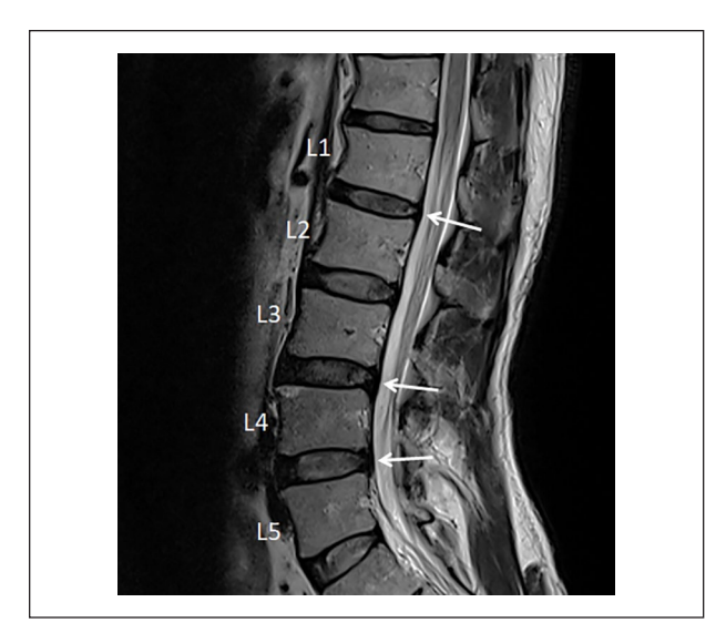
Figure 1. Sagittal T2 weighted magnetic resonance (MR) image revealed marginal osteophyte formation of the lumbar vertebrae and lumbar disc desiccation (low water content/diminished signal intensity) with posterior protrusion at the L1/L2, L3/L4, and L4/L5 levels causing thecal indentation.

systemic diseases. Initial workup by an urologist and an orthopedist found an insignificant right renal cyst, asymptomatic left varicocele, and degenerative lumbar spine disease. A scrotal ultrasound ruled out direct testicular pathologies. For nearly 2 years, he had received pain medication, fluoroscopy-guided lumbar facet joint injection, exercise rehabilitation, and acupuncture, all of which failed to provide substantial, lasting symptom relief. The patient then sought chiropractic care for his condition.